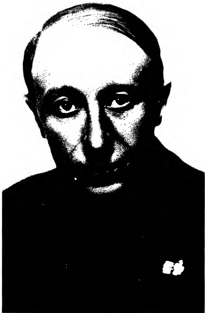
AUGUSTO TURATI, Secretary of the Fascist Party.