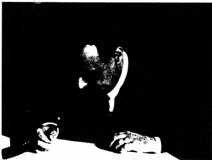
HIS EXCELLENCY SIGNOR ALFREDO ROCCO, Minister of Justice.